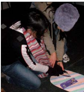
The chocolate game— fun for every age group!

And we had a lot of fun! We played some games, including the very popular